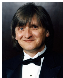
Yuri Shevchenko, Honoured Artist of Ukraine

Based in Kyiv, Ukraine, Yuri is acknowledged as one of the finest composers in the Ukrainian classical