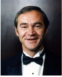
Viktor Lytvynov, National Artist of Ukraine

As a soloist with the Kyiv Ballet of the National Opera of Ukraine in the 1960's, Viktor Lytvynov was